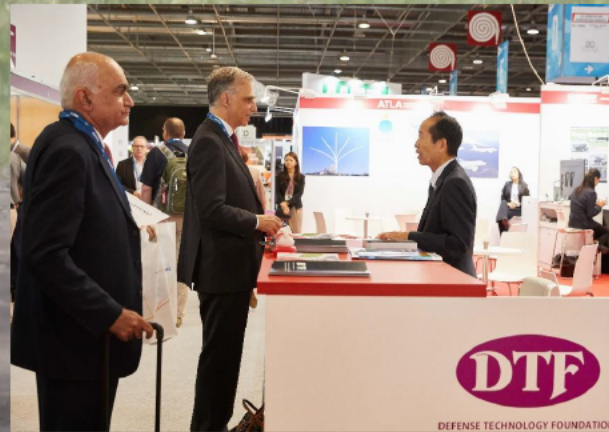
At the Eurosatory 2018