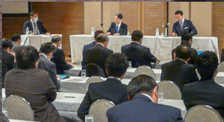
Defense Technology Seminar

Defense technology lectures and seminars for companies, researchers, and engineers.