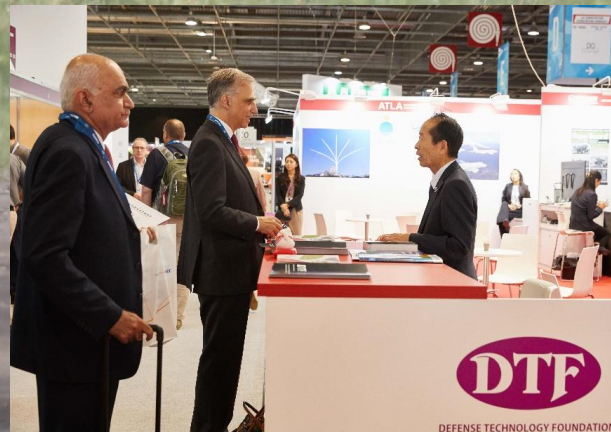
At the Eurosatory 2018