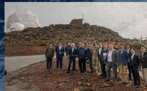
Overseas survey team

A monthly magazine publishing articles on defense-related technologies and topics written by experts in various fields to disseminate knowledge on defense technologies