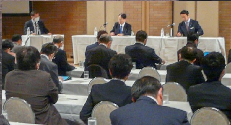
Defense Technology Seminar

Defense technology lectures and seminars for companies, researchers, and engineers.