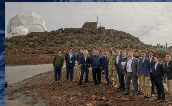
Overseas survey team

A monthly magazine publishing articles on defense-related technologies and topics written by experts in various fields to disseminate knowledge on defense technologies